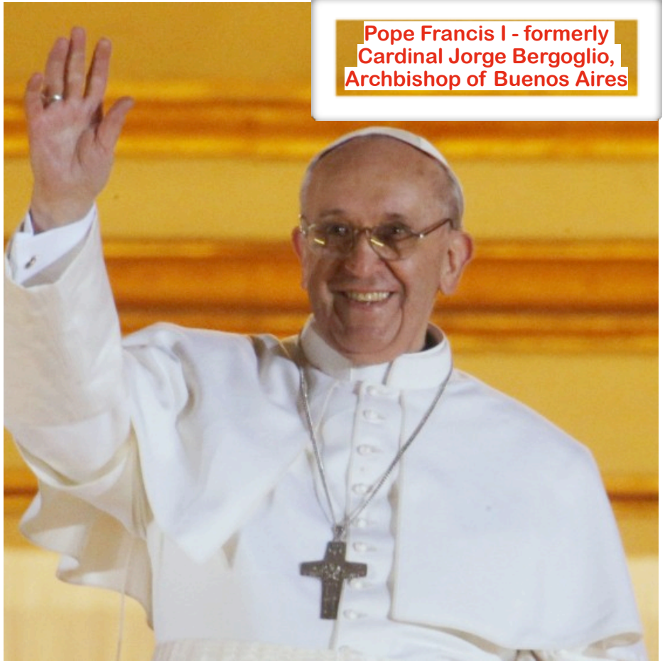
Pope Francis I - formerly Cardinal Jorge Bergoglio, Archbishop of Buenos Aires

ST MARGARET'S LOCHGILPHEAD & INVERARAY NO 16